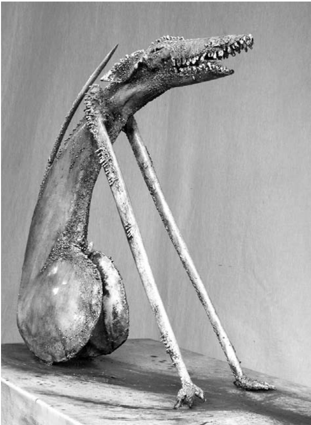
"Cuzco pampuca", hierro forjado y soldado Rubén Schaap