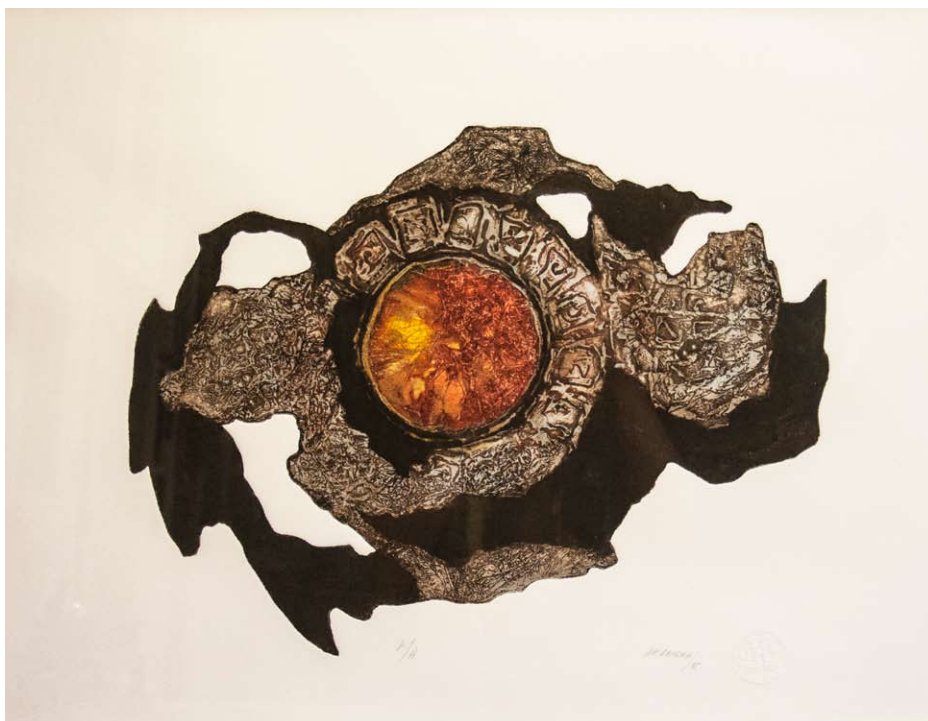
“Birth of an asteroid”, collagraph. Marta Arango

In this same act, the dialogical dialectic of the humanizable act is re-inaugurated, which questions the possibility of the knowledgeable as a condition of psychosocial complexation. This is conceived as an extension of the representational field in the development of reflexive processes, which places self-consciousness in relation with others and the world. In this manner, education deploys the humanizable side of what is human in terms of the acknowledgement of acquisitions that leave a trace in the subject’s conscience. Such conscience locates subjects as the core components of social action and as predicates of their practices (Charaudeau, 2009).